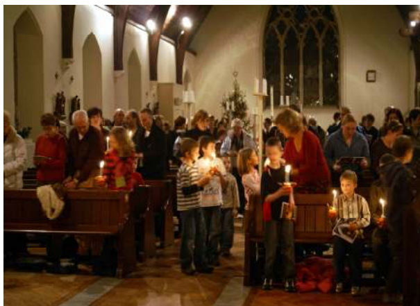
The Annual Christingle Service

Members of the congregation have a range of views on women priests and bishops, but there is broad support for the idea that St John's should continue to provide a home for adherents of the Anglo-Catholic tradition who cannot in conscience accept women priests and bishops. Following the Priests (Ordination of Women) measure in 1992 the PCC passed Resolutions A, B and C. All three Resolutions have recently been reconfirmed. Episcopal care was provided by the Bishop of Fulham until the end of 2010 and at the time of writing is being provided by the Bishop of Edmonton, until such time as a more permanent arrangement is made. The parish is affiliated to Forward-in-Faith.