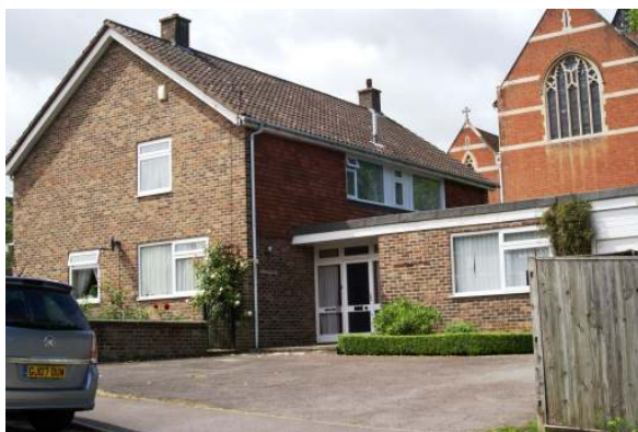
The Vicarage and Parish Office

THE VICARAGE: The present vicarage was built in 1968 and is situated adjacent to the church. It comprises: 5 bedrooms, toilet and bathroom upstairs and dining room, sitting room, kitchen, utility room, study and toilet downstairs. There is a garage and a large well laid-out garden.