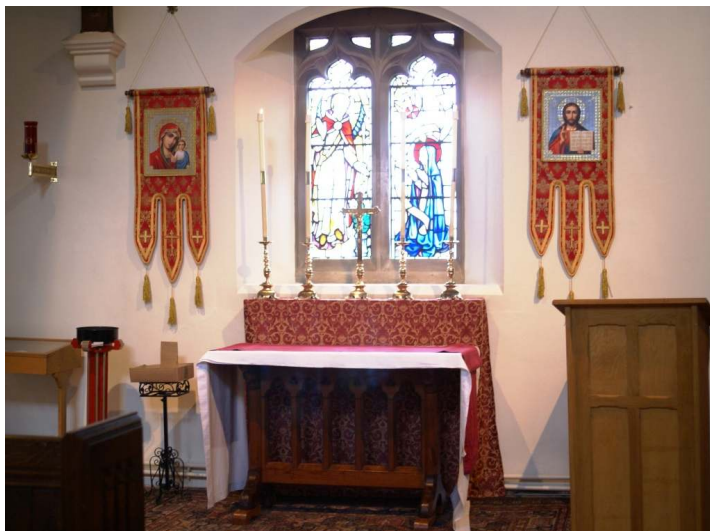
The All Souls Altar