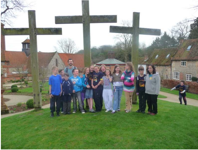
Children's Pilgrimage to Walsingham