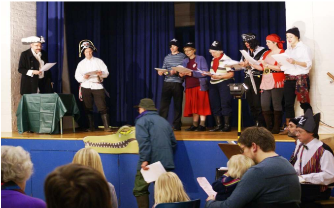
The Annual Parish Pantomime