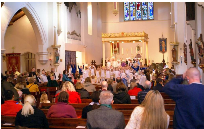
St John's School's Nativity

other who acts as clerk to the governors. The chairman leads an act of worship once a week in the church for the school and two of the governors help on a weekly basis in the school.