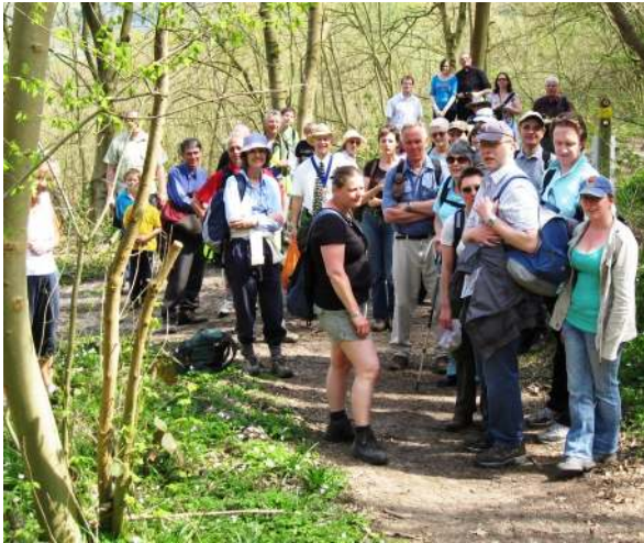
Walkers on the Pilgrimage to Canterbury