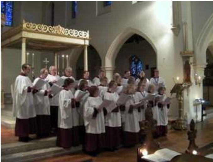
St. John's Choir

The church has a strong and long-established musical and choral tradition. The parish is greatly appreciative of the dedication and professionalism of its organist and choirmaster. Children in the choir progress through the Royal School of Church Music tests. The choir is able to offer a communion motet for every sung service and a full Nine Lessons and Carols at Christmas. The adult contingent are loyal, committed church members and able musicians. For many years settings of the Mass by such composers as Haydn, Mozart, Schubert and others have been used for the church's Patronal Festival. St. John's is very fortunate in being able to call upon further singers at these times to augment the regular choir and upon a number of instrumentalists to provide orchestral accompaniment.